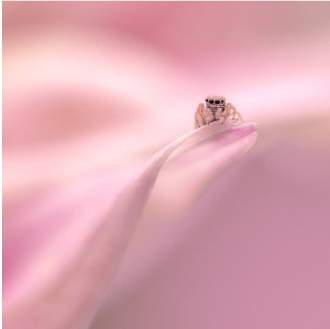
“Jumping Spider in a Dahlia”

While shooting close-ups of dahlias, I found this little guy watching me. I managed to shoot 6 frames before he moved away. Only this image was in good focus. I was hand-holding the camera with manual focus, and I had it set at its minimum focus distance and largest aperture. I slowly rocked forward and backward until the focus peaking showed the spider was in focus.