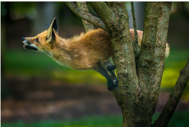
“Desperation” By Stan Collyer

Self-Portrait: The subject (me) and the background were photographed separately and combined in PhotoShop. The lighting on the background was also added in PhotoShop.